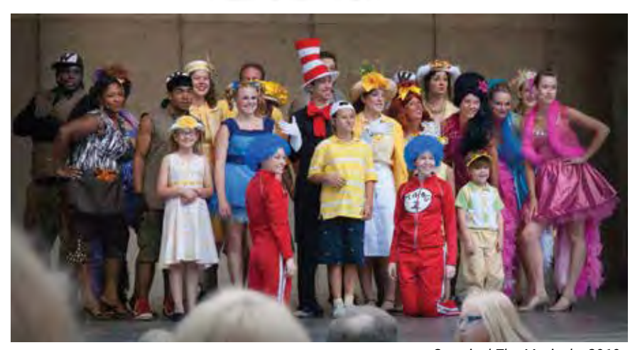
Seussical The Musical - 2010