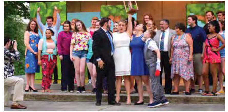
Disney's Freaky Friday - 2019

Donating to the Kindleberger Festival Fund will allow for this art enriching festival to continue providing theatrical performances and concerts to people of all ages in and around the Parchment community. Please consider donating with the QRcode provided.